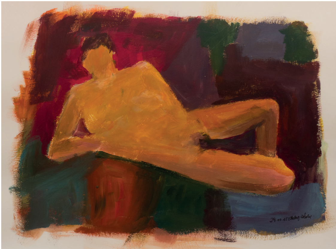
Jutta Ebeling-Dehnhard Female nude with colored background, 2015 acrylic on white paper, 9.05 x 12.20 inch